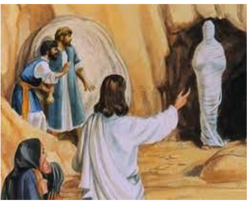
Fifth Sunday of Lent A: March 26, 2023

209 3rd Street, Jersey City, NJ 07302 Office hours: Monday-Friday: 9AM-5PM Parish E-mail: info@stmarysparishjc.com Phone: 201-434-8500 Fax: 201-333-1816