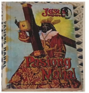
PABASA April 1, 2023: 7:00AM