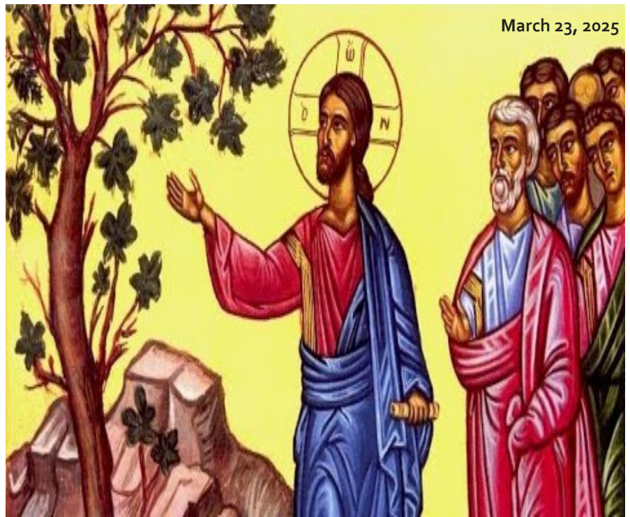
THIRD SUNDAY OF LENT